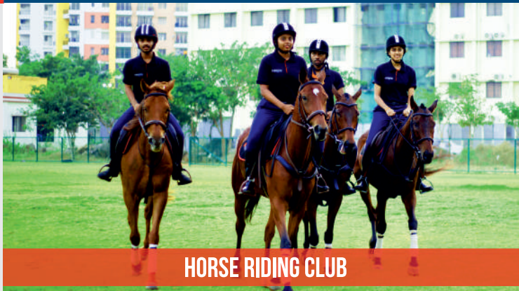
HORSE RIDING CLUB