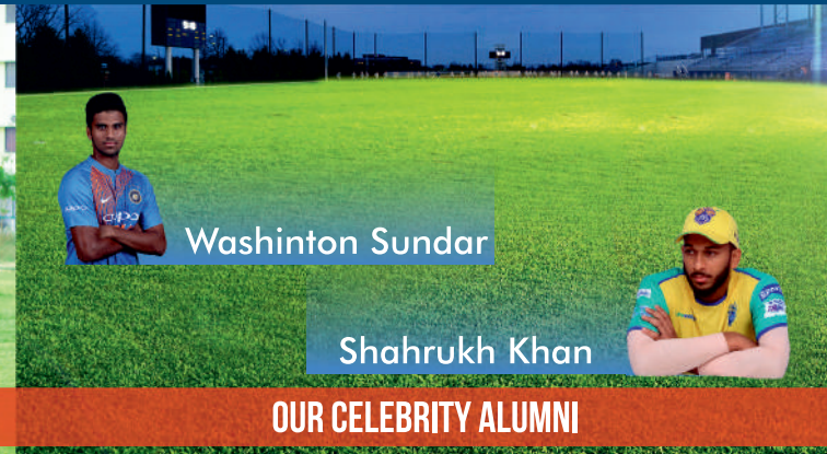
OUR CELEBRITY ALUMNI