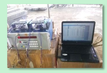
Data Acquisition System