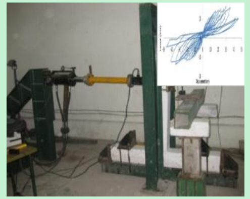
Study on High volume fly ash concrete