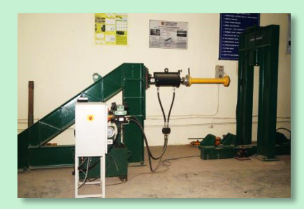
Reversed Lateral Loading Frame