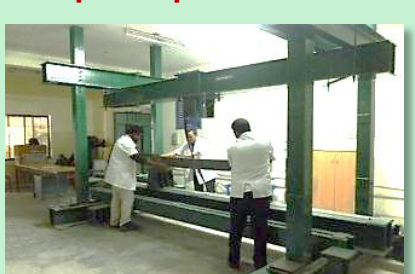
Vertical Loading Frame