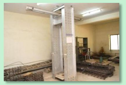
Column Testing Frame