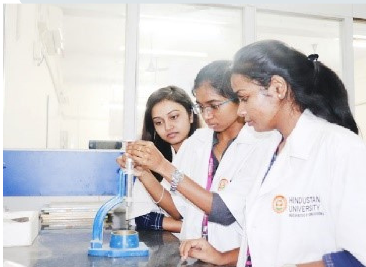
Environment Engineering Lab