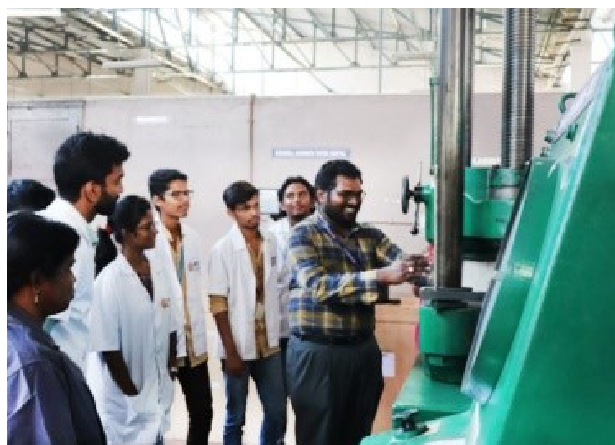
Structural Engineering Lab