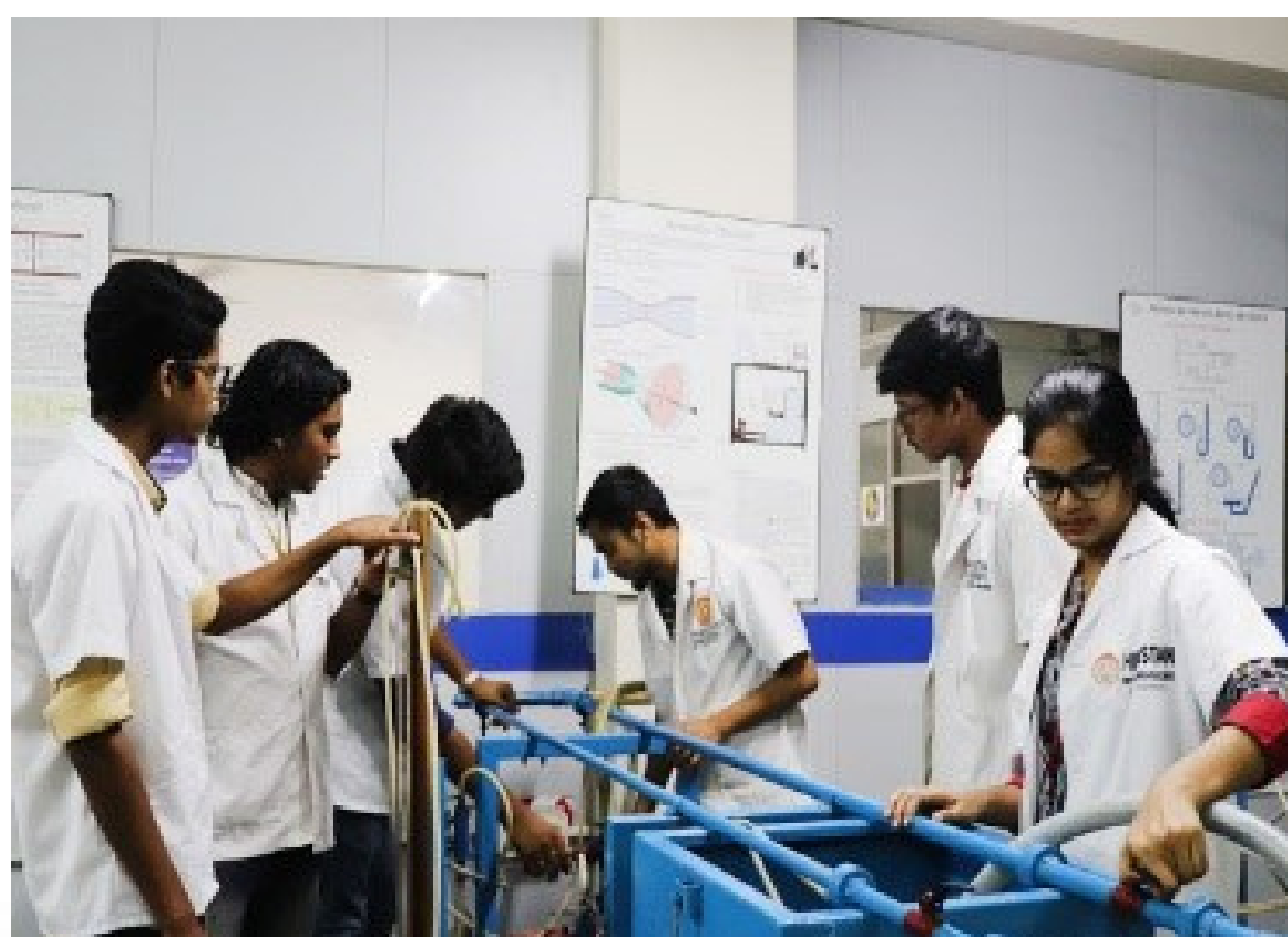
Hydraulic Engineering Lab