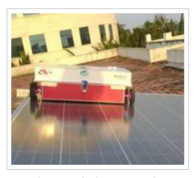
Solar Panel Cleaning Robot