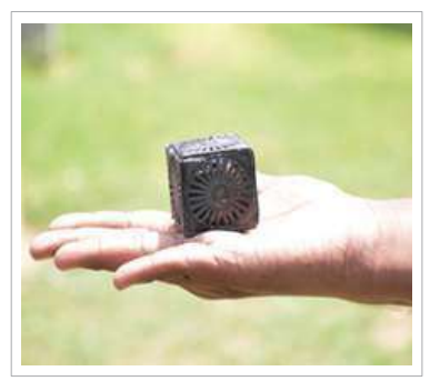
World's Lightest Satellite