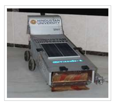
Road Cleaning Robot