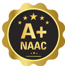
National Assessment and Accreditation Council (NAAC) A+ grade with a CGPA of 3.48