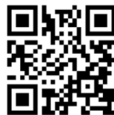
QR Code for Library Login

h. Library will be closed on select holidays.