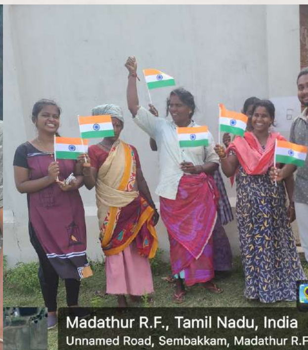
Madathur R.F., Tamil Nadu, India Unnamed Road, Sembakkam, Madathur R.F.