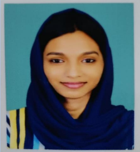
Farsiya. AV B.Sc 1 st year