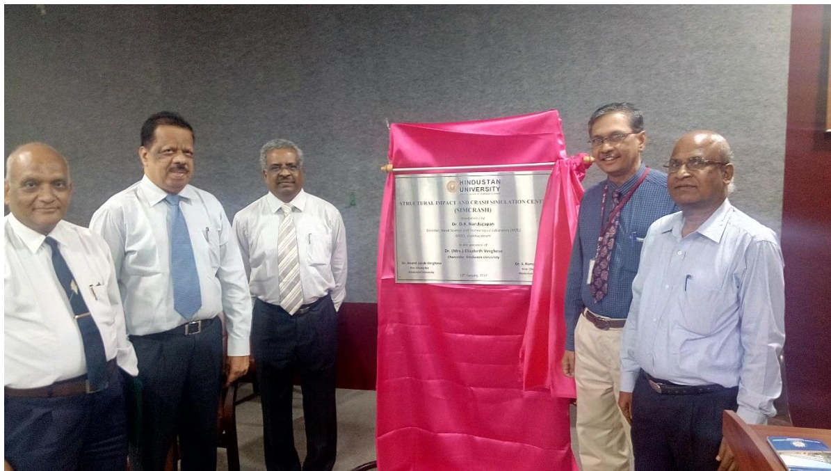
Inauguration of SIMCRASH centre

Structural Impact and Crash Simulation Centre (SIMCRASH) was established at the Hindustan Institute of Technology and Science (HITS) on 12 th January 2017 to promote educational and research activities in the field of structural impact and crash analysis. The centre bridges the gap between the industries, research institutes and the University with a distinct capability to harness the intellectual energy of academia to solve the real time problems faced by the industry and the defence forces. SIMCRASH is a multi-disciplinary research centre dedicated for solving real world structural impact and crash problems through the application of modelling and simulation techniques and to develop new approaches in material modelling for structural impact crash problems.